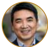
Eric Yuan, Founder and CEO, Zoom