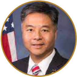
HON. TED W. LIEU

United States Representative; Vice Chair, House Democratic Caucus