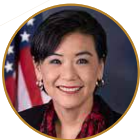
HON. JUDY CHU

United States Representative; Chair, Congressional Asian Pacific American Caucus