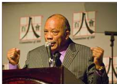
Enlarge Committee of 100

"I don't pretend to be a politician," Quincy Jones said. "I'm just a musician who cares."